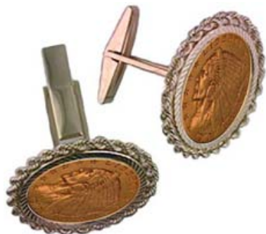
Rope Style, Diamond Cut