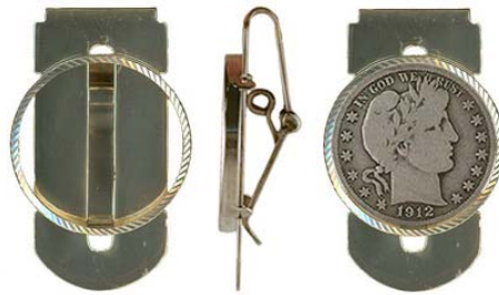
Half Dollar Money Clip (without and with coin)