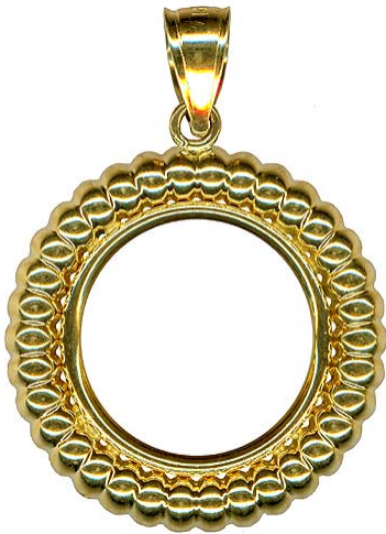
Special Design (front and side)

Prong-back bezels are elegant coin frames available in a range of designs and styles and can be made in 14kt gold, gold filled, or sterling silver. The coins are inserted in the frame and then prongs are folded behind the back of the coin to hold the coins securely in place. A bail (included with each bezel) then allows the bezel to be suspended on your favorite chain. Bezels may be ordered with bails.