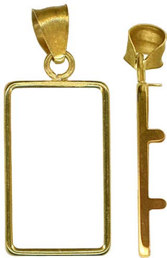
Rectangle Style for Wafers (front and side)