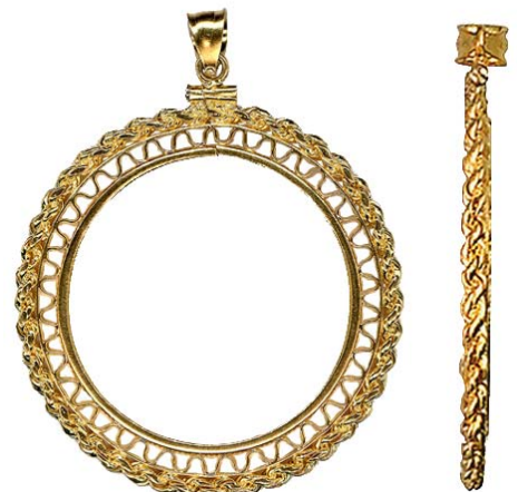
Gallery Wire (front and side)