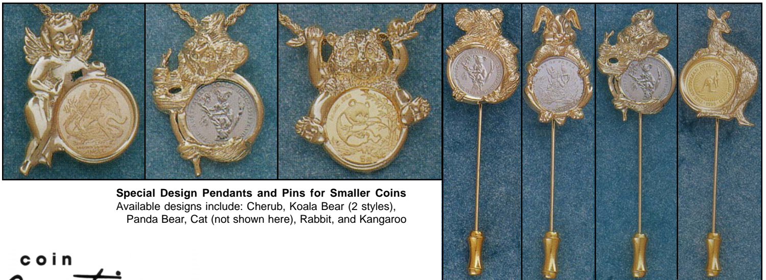
Special Design Pendants and Pins for Smaller Coins Available designs include: Cherub, Koala Bear (2 styles), Panda Bear, Cat (not shown here), Rabbit, and Kangaroo