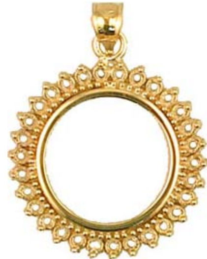
Diamond or Other Stone Setting