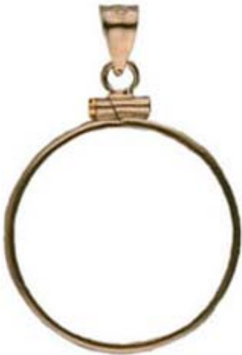
Plain Style, Gold

Screw-top bezels are elegant coin frames available in a range of designs and styles and can be made in 14kt gold, gold-filled, or sterling silver. The coins are set in channels that are fastened at the top, leaving the coin in perfect shape without any damage and with a nice even finish on both sides. A bail is included with each bezel.