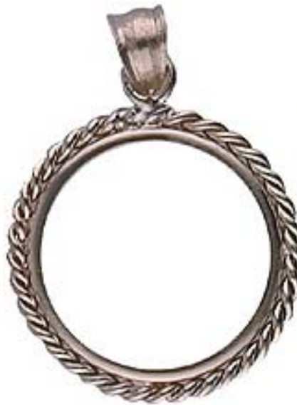
Twistwire Style (front and side)