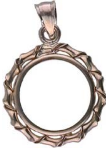
Bamboo Style (front and side)