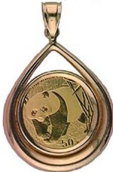
Teardrop Style (front)