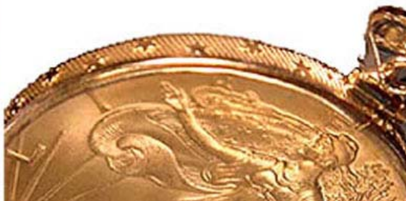
'Stars and Stripes Forever' Special Channel Design