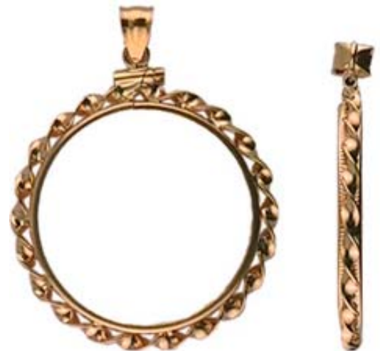
Ribbon Style (front and side)