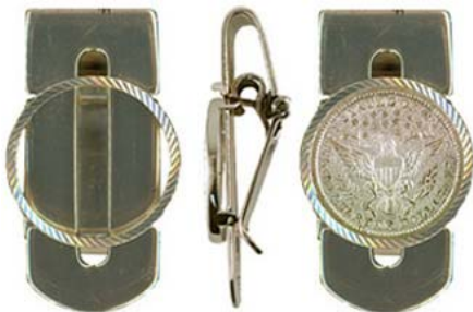
Quarter Dollar Money Clip (without and with coin)