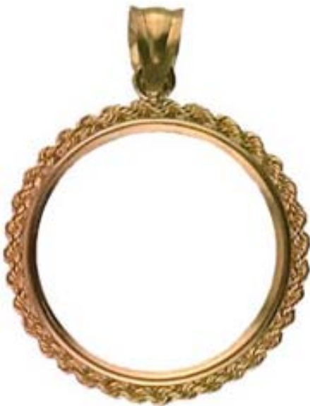
Rope Style (front and side)