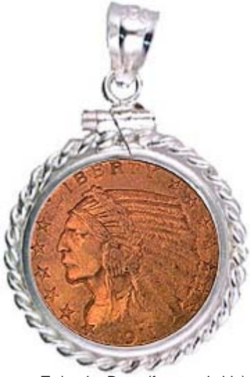
Twistwire Rope (front and side)

Using special manufacturing techniques, we can make complex designs that enhance and show off the beauty of the coins they house. The faces can be detailed with diamond cutting and double diamond cutting and the bezel edges can be plain (smooth) or serrated like a coin. Some styles can be combined for added effect, for example Rope styles can be twisted.