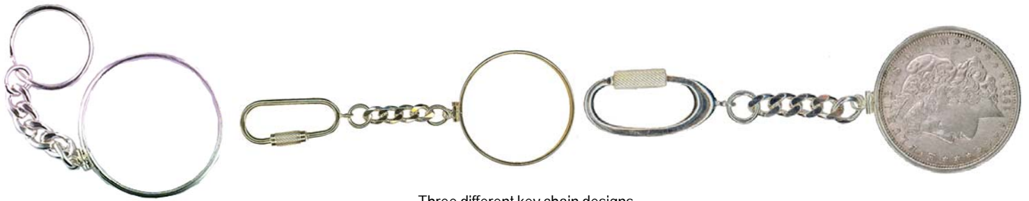
Three different key chain designs