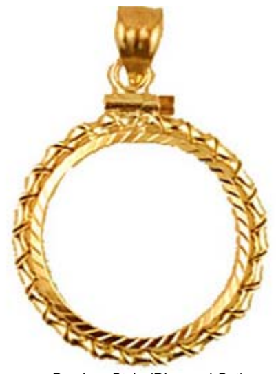
Bamboo Style (Diamond Cut)

For a better selection and finishing screw top bezels give a nice clean finish on both sides and available for standard size and custom orders, coins, medallions or stones. Choose the best, choose Coin Creations.