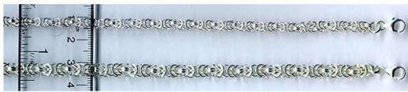
Byzantine Style Sterling Silver Chains