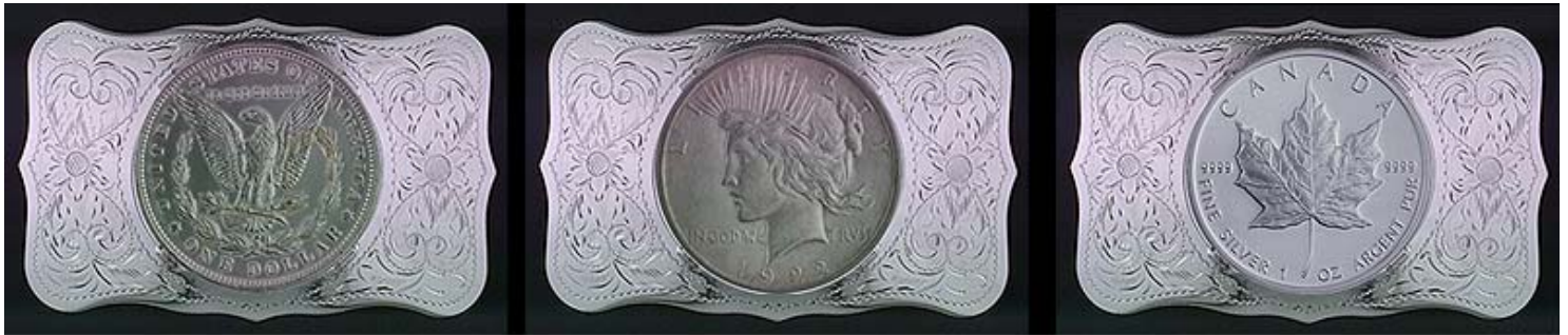
Belt Buckles are available with coin only, or we will install your coin.