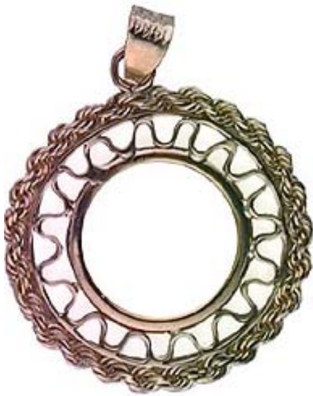
Gallery Wire (front and side)