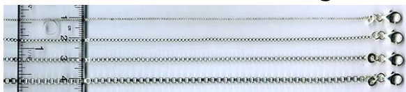
Box Style Sterling Silver Chains

All are 18" length, rope, handmade, diamond cut. Available gauges are 1.5 mm, 2.0 mm, 2.5 mm, 3.0 mm, or 4.0 mm.