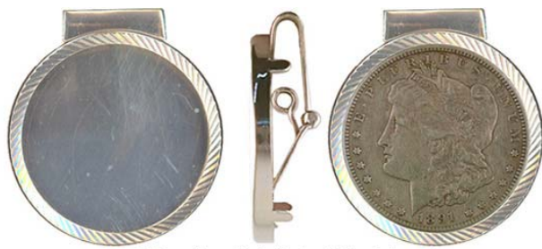
39.8 mm Money Clip (without and with coin)