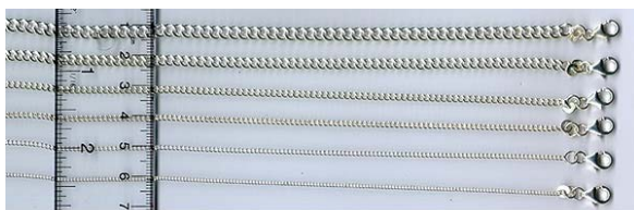
Curb Style Sterling Silver Chains