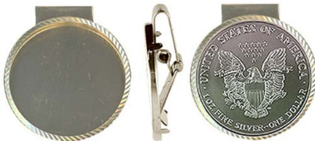
Silver Eagle Money Clip (without and with coin)