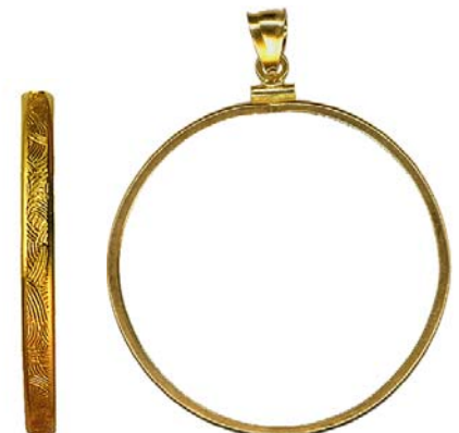
Retro Style (Side and Front View)