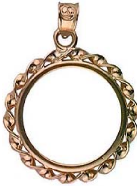
Ribbon Style (front and side)