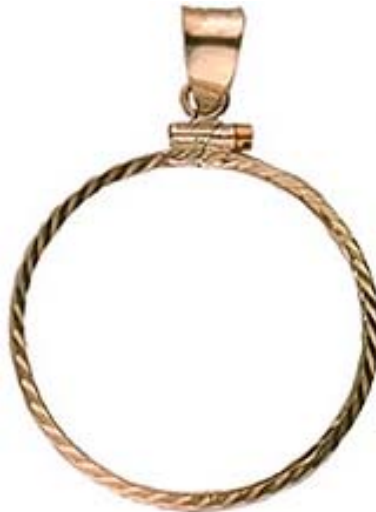
Double Diamond Cut