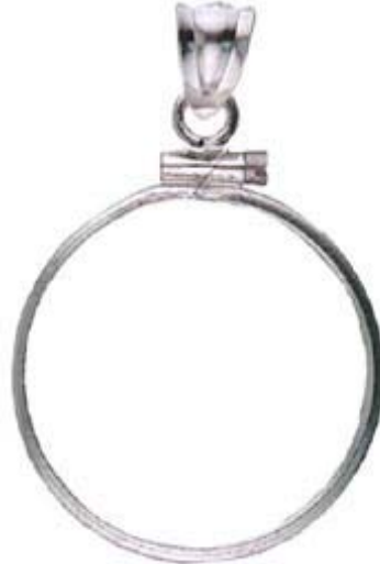
Plain Style, Silver