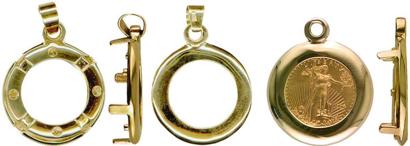
New Design 1 (Front, Side and Back)

The new standard of top quality coin bezels as designed and created by Coin Creations: prong bezels finished on both sides.