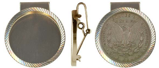
Silver Dollar Money Clip (without and with coin)