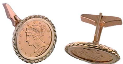
Twistwire, Diamond Cut