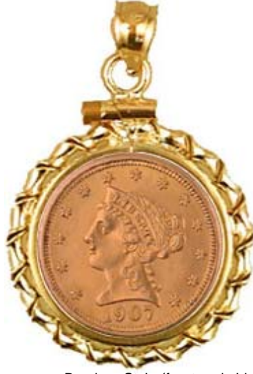
Bamboo Style (front and side)