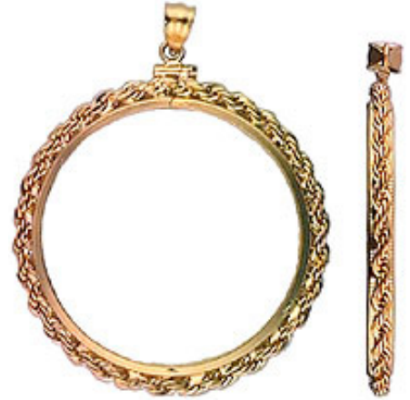
Rope Style (front and side)