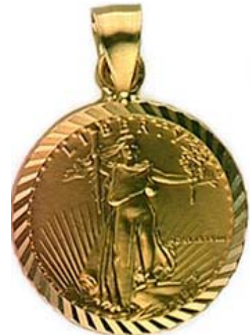
Diamond Cut (front and side)