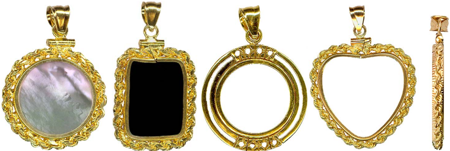
Mother of Pearl